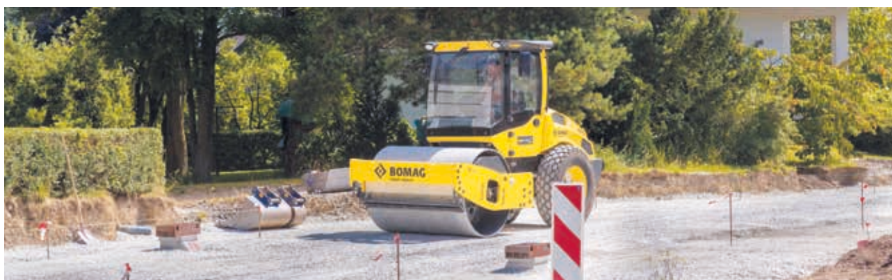
The expert for inner cities.