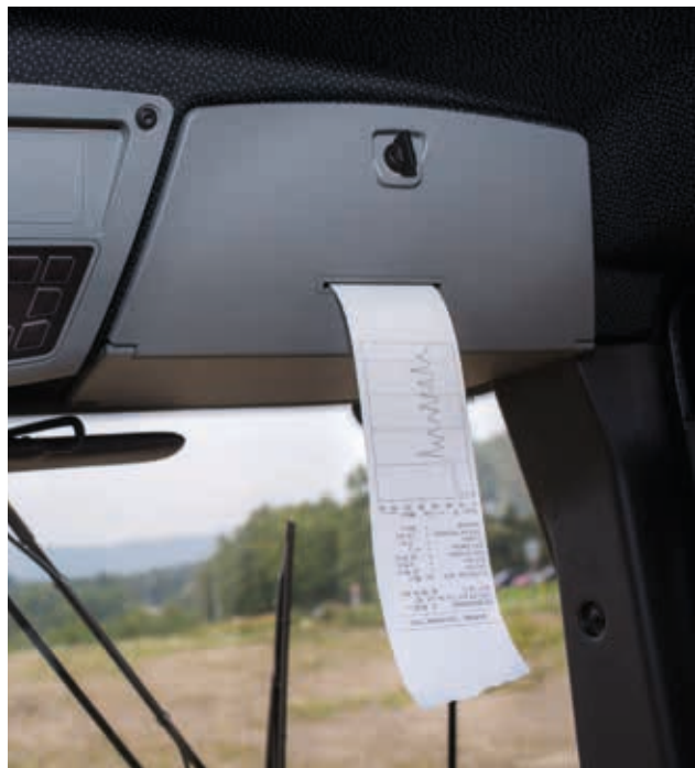
Integrated printer: for documenting compaction values.