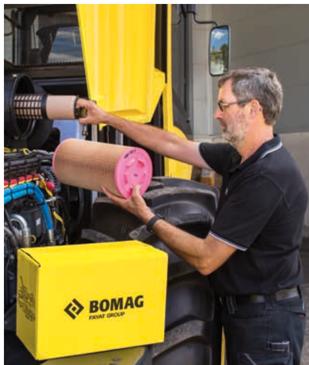
BOMAG Service Kits: all maintenance parts in one box.