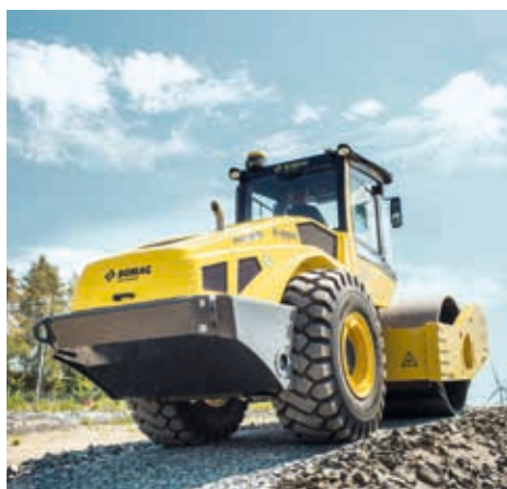
The heavyweight for major construction sites.