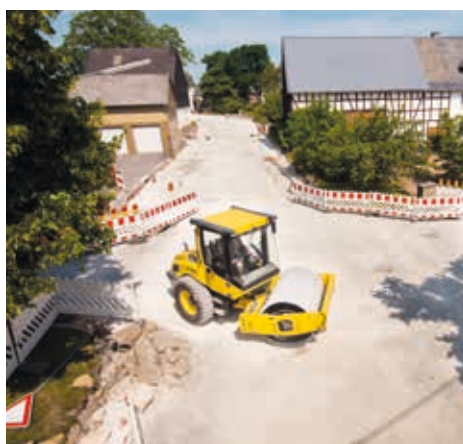
The nimble one for tight spaces.