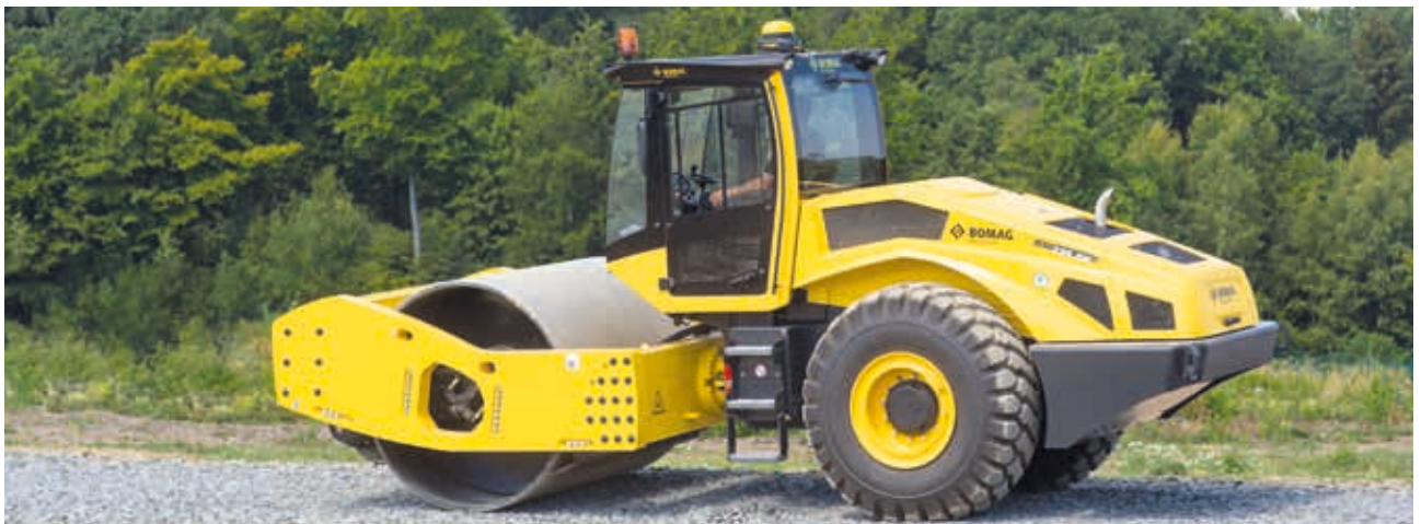
Know what's going on: surface covering compaction control, layer by layer, over the entire site.