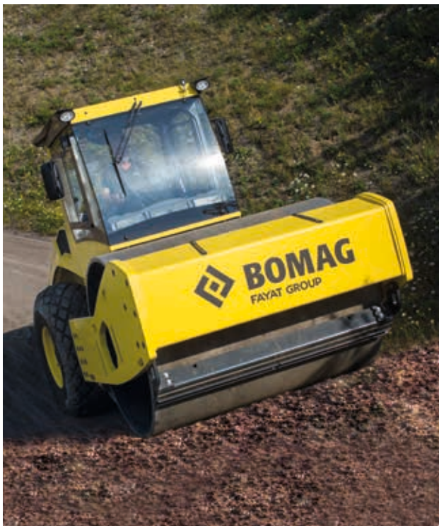
Outstanding climbing capability forwards or backwards ...