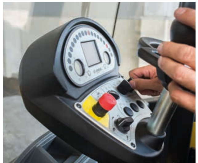
The controls: logically arranged and self-explanatory.