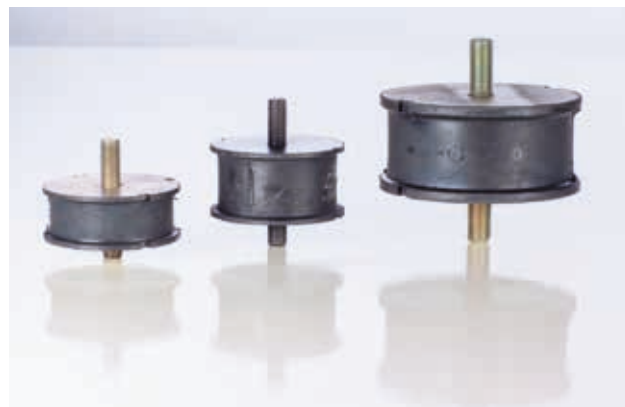
BOMAG Genuine Parts: matchless proven quality.

BOMAG Service stands for quick and reliable on-site assistance. With 12 foreign subsidiaries and more than 500 dealers worldwide in over 120 countries.