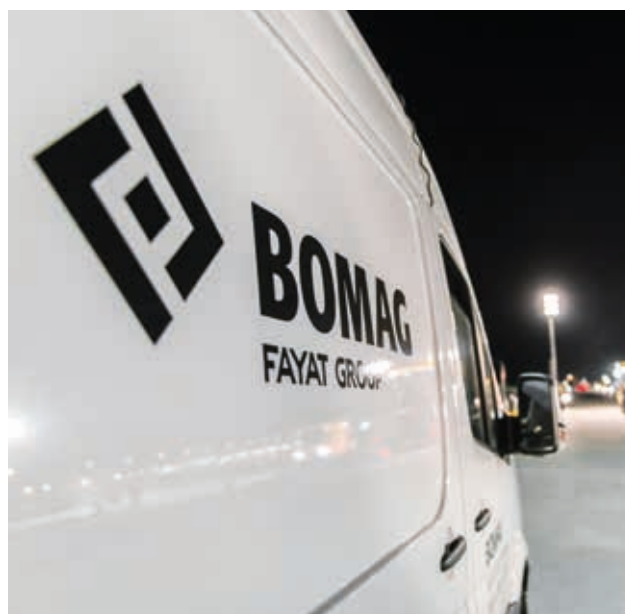
BOMAG Services: No matter where your machine is in use, we won't let you down.

3. BOMAG PartnerPlus. With this service contract you get peace of mind at a calculable price. You can put your own personal package of services together according to your requirements. That means flexibility that protects against unexpected costs and facilitates long-term planning.