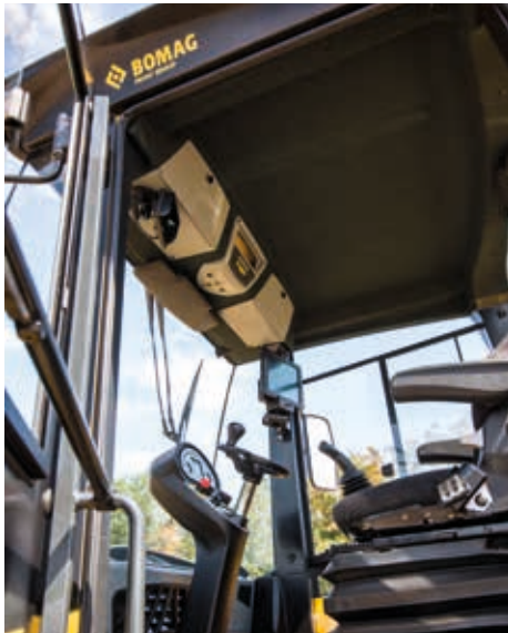
Clearly visible, never in the way: the display in the cabin.