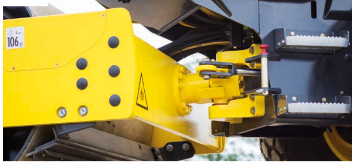
Cleanly engineered: The articulated joint is maintenance-free, the machine requires no lubricating whatsoever.