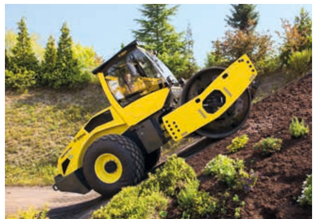
... thanks to the dual pump system technology.