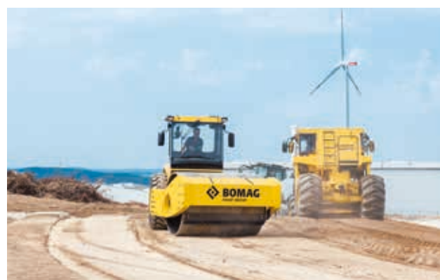
The perfect companion for large projects.

With a high cubic metre capacity, these single drum rollers are extremely efficient. That's why they are used for heavy compaction work with high layers: on major road construction projects, at airports, in dam construction or land reclamation. The depth effect of the large single drum rollers is enormous, and further enhanced by the polygonal drum, available only at BOMAG.