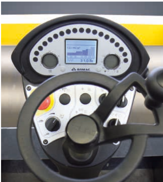
Integrated display: clear and informative.

Drivers with the optional TERRAMETER, developed by BOMAG, receive additional support. It displays the respective compaction value digitally and as a bar graph. Furthermore, it is easy to see when compaction has been completed. This avoids unnecessary passes and saves time, therefore increasing economic efficiency.