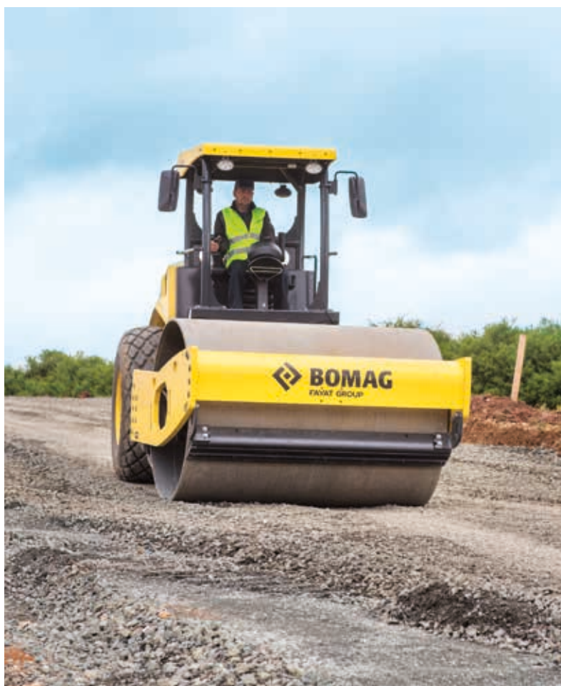
The all-rounder for all eventualities.