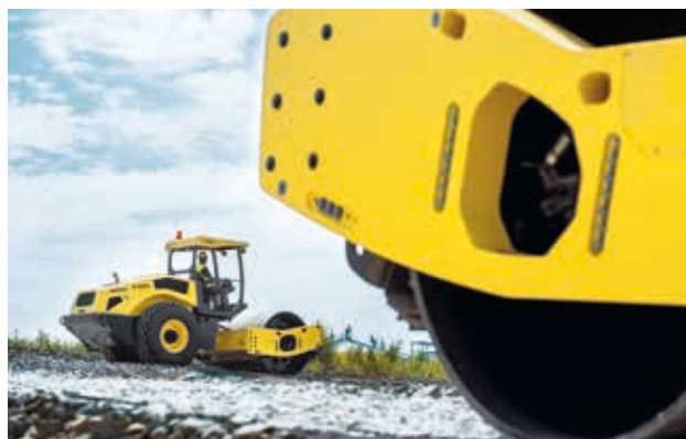
Versatile machines for wide-ranging applications.

These single drum rollers are used for medium to heavy compaction work. Equipped with VARIOCONTROL, they are ideal, for example, for the construction of expressways or railway lines. BW 213 can be additionally fitted with attachment plates so it is able to carry out depth and surface compaction in one operation. This saves time and costs.