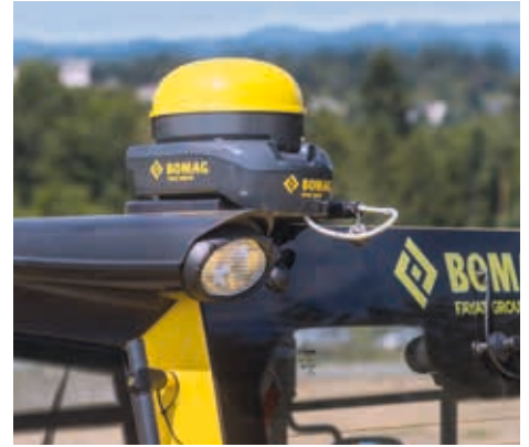
BOMAG StarFire: precision by GPS.