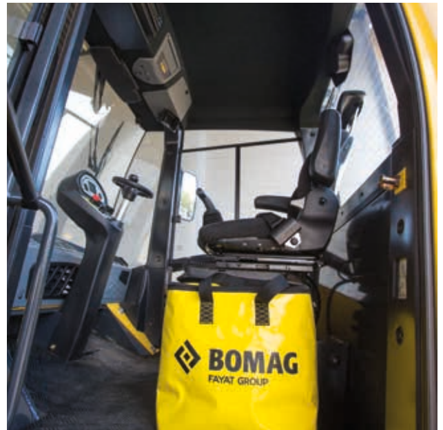
The cabin: airy and comfortable.

Workplace comfort has many facets in our single drum rollers. Space, air, ergonomics – everything is taken care of. Ideal conditions for well-being and working more successfully.