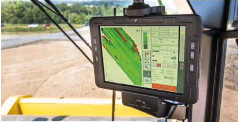
In colour: clear compaction maps with current values.