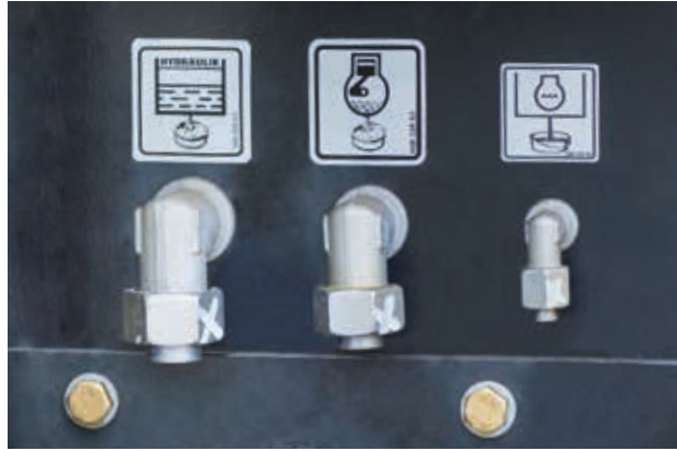
Intelligent: operating materials can be drained off from the outside.