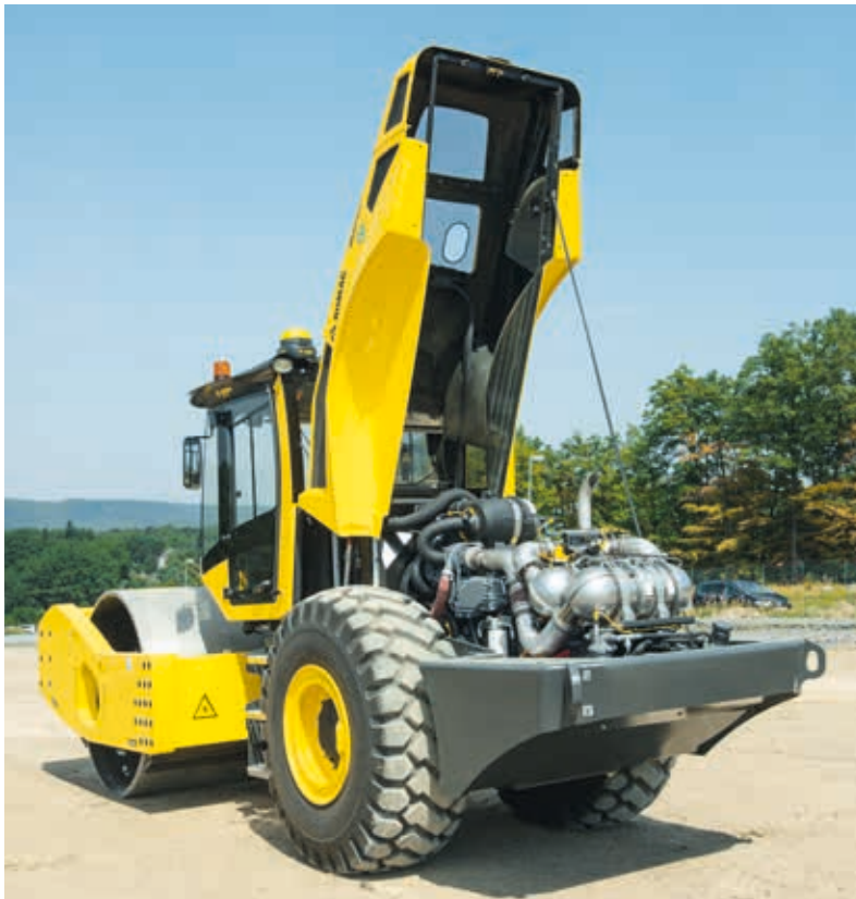
Big mouths welcome: all maintenance points easily accessible.