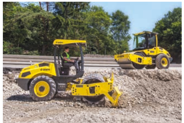
ROPS / FOPS cabin

Particularly comfortable: the BOMAG ROPS / FOPS cabin offers a wide range of equipment such as heating / air conditioning, radio-ready, or space for a cool box.