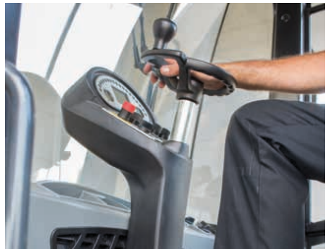
The steering column: perfectly adapted to the driver.