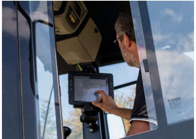
Always in the picture: fast access, clear documentation.