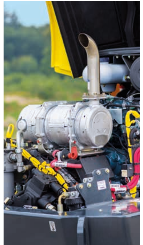
All cables are protected from damage.