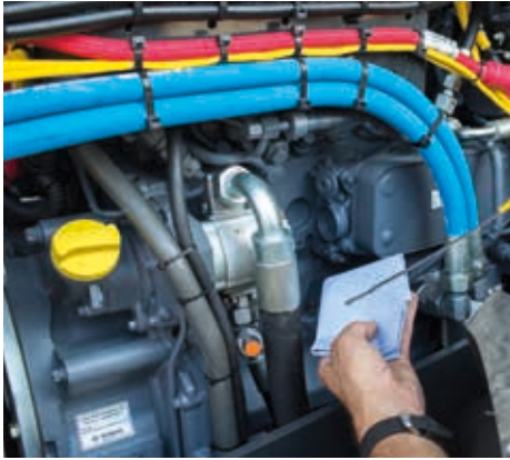
Found before you even start searching for them: the maintenance points.